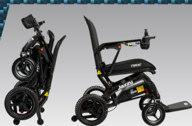
Easy Fold Design that locks into a folded position